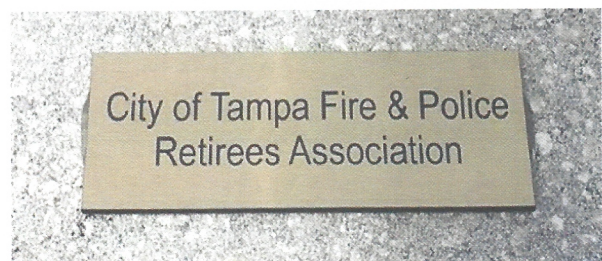
This Plaque is at the base of their flag.